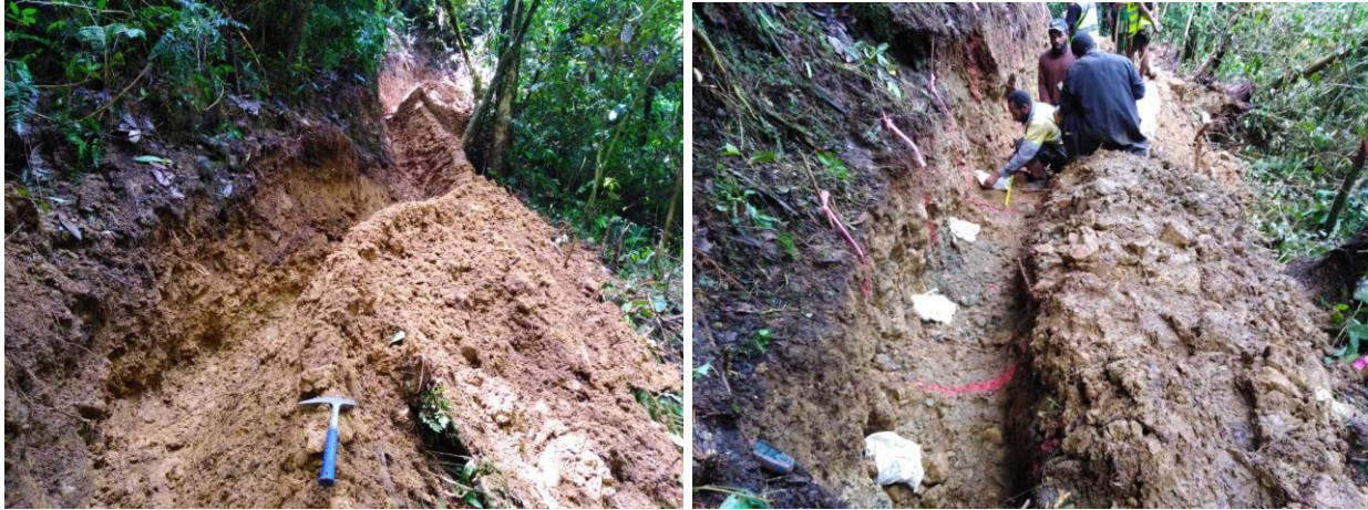
Figure 2: Trenching Activities at Mongae Creek