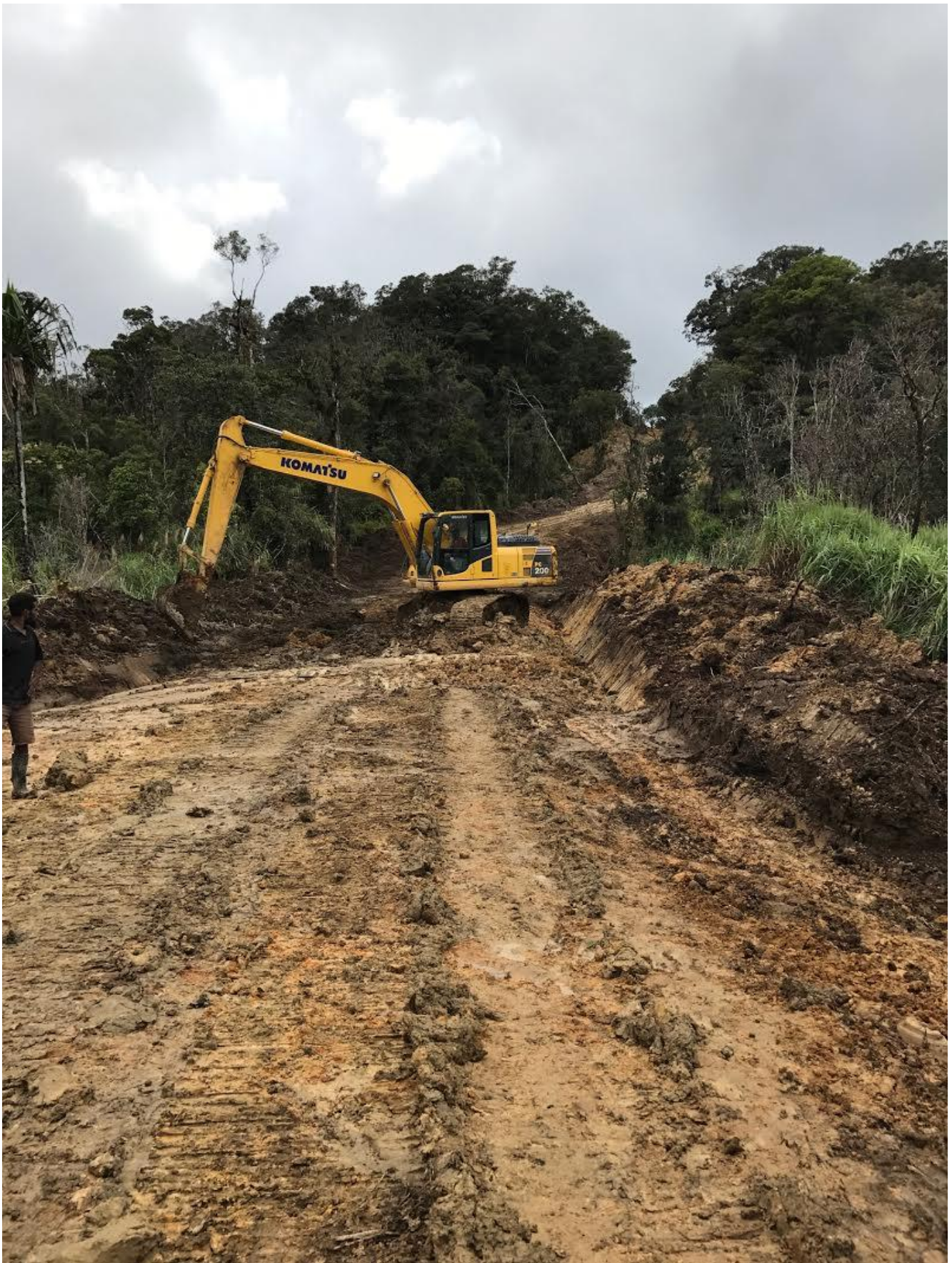
Figure 2: Road construction underway in preparation for the next exploration phase