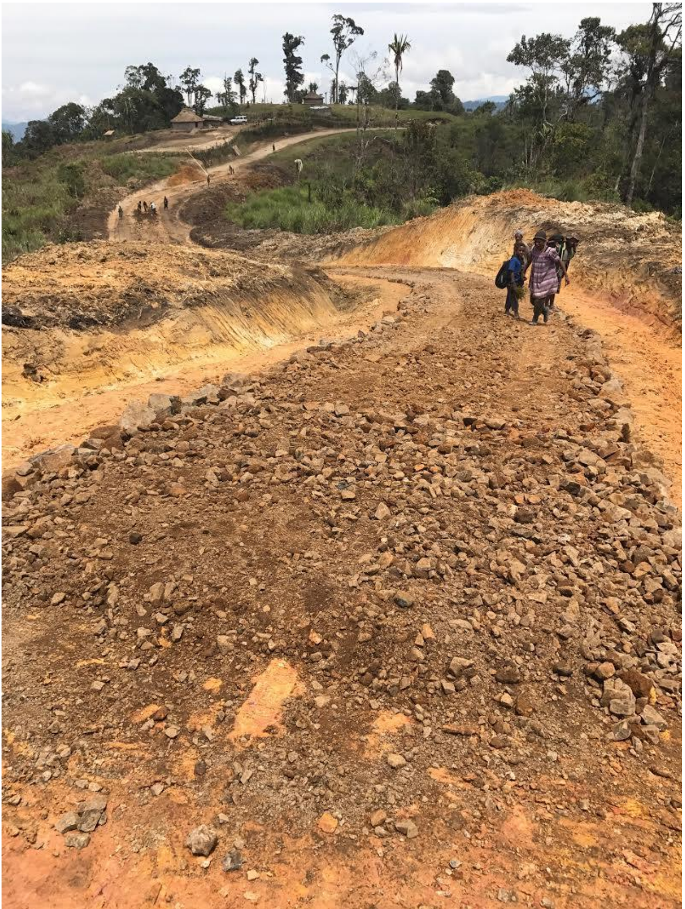
Figure 3: Completed road